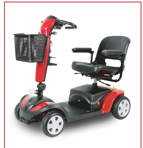
International tiller shown

NOTE: All specifications subject to change without notice. The information contained herein is correct at the time of publication; we reserve the right to alter specifications without prior notice. Speed and range vary with user weight, terrain type, battery charge, battery condition and tyre pressure.