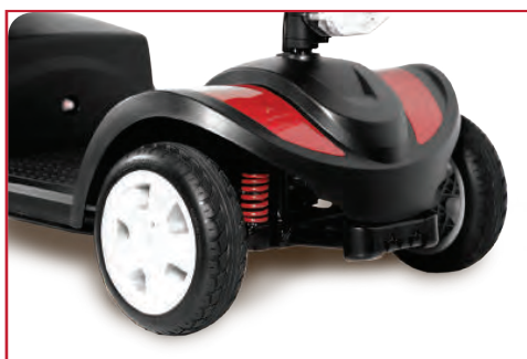
Full advanced suspension

Be free to go where you want to go! The GT offers full advanced suspension for a smoother, more comfortable ride over varied terrain. Front and rear LED lighting illuminates your path and the adjustable delta tiller allows for easy, one-handed operation. Experience the GT feeling for yourself!