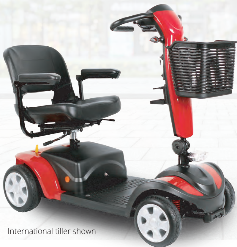
International tiller shown